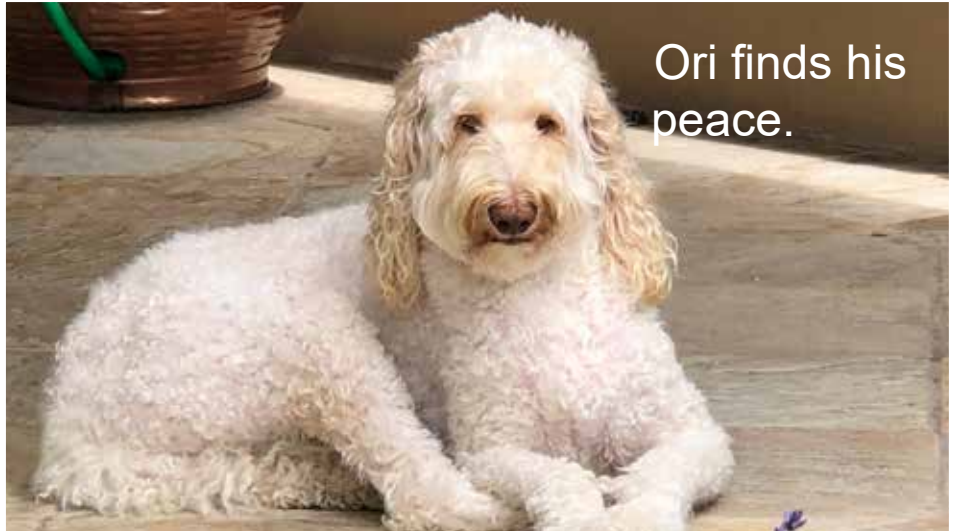
Ori finds his peace.

My personal connection to Ori? Last November we lost our precious 11-year-old Goldendoodle, Buddha, to the ravages of cancer. Heartbroken, we weren't considering another animal so quickly; but