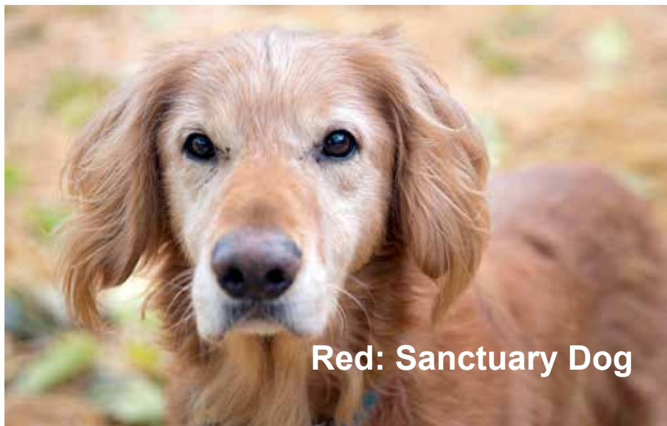
Red: Sanctuary Dog

This year's featured dog is Red, one of our sanctuary dogs. He and his posse