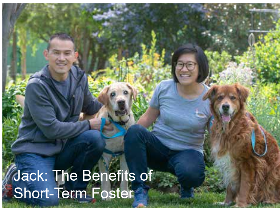
Jack: The Benefits of Short-Term Foster

You can help us to expand our reach by sharing our newsletter with friends, family and co-workers! Thank you!