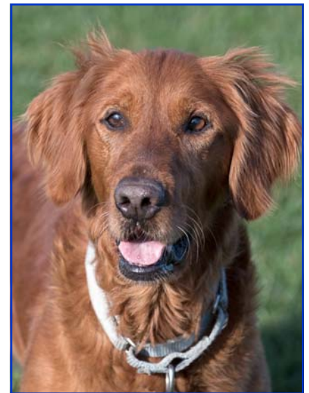
Kaylee today! Just look at those beautiful brown eyes!

Just look at Kaylee now! We are delighted to report that she has gained significant weight, her diabetes is now stabilized, and she has undergone successful eye surgery! Today Kaylee is a happy, bouncy bundle of energy. Now she can see her squeaky toys and the ball she loves so much. She will keep returning the ball it as long as you'll continue to throw it. And when you stop throwing it, she will drop it at the feet of one of the dogs and look at them hopefully. She asks for attention and affection, and is thoroughly engaged in life and bursting with joy! What a transformation, and we couldn't be happier.