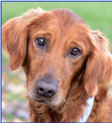
Kaylee before surgery

Some of you have been following Kaylee's progress. This sweet nine-year-old golden girl came to us from a shelter where she had arrived badly emaciated, weighing just 34 pounds, just over half of her ideal body weight. Her diabetes was out of control. Cataracts had rendered her blind. She was depressed to the point that she had just about given up on life. Our hope was that eventually we would be able to do surgery on Kaylee's cataracts to restore her vision. But first we had to get her diabetes stabilized and help her gain weight. And we weren't certain that she would be a good candidate for surgery.