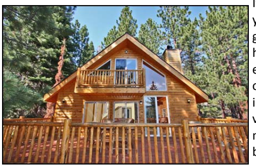
Tahoe Luxury Home

cation offerings include Meadowood Napa Valley Resort, a ridgetop retreat in the Anderson Valley wine country, a Lake Tahoe luxury vacation home, and a Penthouse condo in Los Cabos, Mexico.